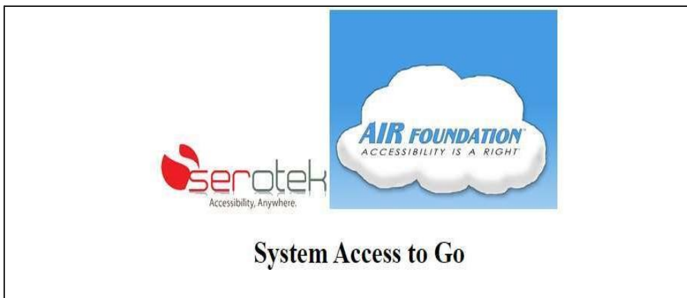
Screen reader software

Following Software installed in Computer: